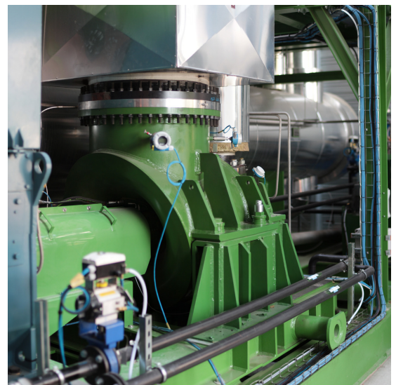
Enertime 2 MWe ORC turbine, Caen, France